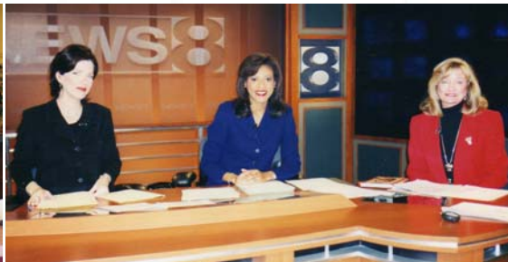
Interview on WFAA Channel 8 In Dallas (ABC)