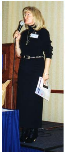
Lane speaking at a women’s conference