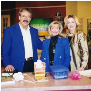
“At Home – Live” Family Network TV